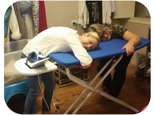
GMS Costumes recently purchased a new ironing board which extends extra high to suit our taller volunteers. The ladies in the costume shop are clearly in love with the new purchase.